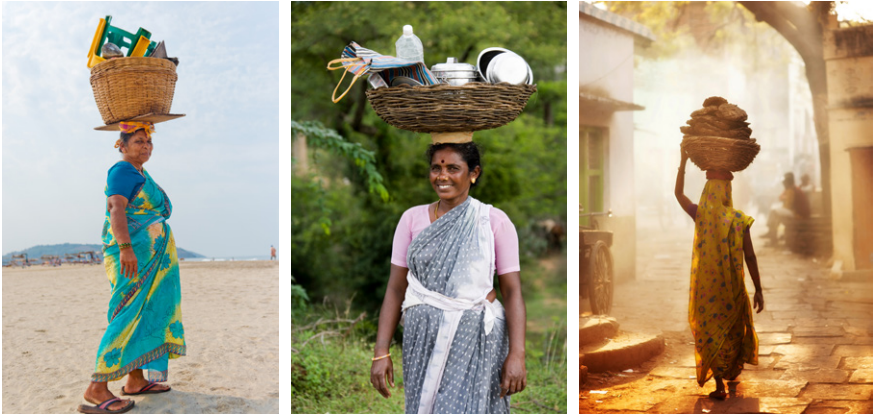
Figures 2–4: Three women carry baskets on their head, and the weight drops through them. 29

terns of action and re-action ( karma )? Consider the long-time practice still evident in many rural, non-Western cultures, where one carries a heavy basket of food or other items on their head. In Figures 2–4, these women stand beneath a weight but show no sign of suffering. Contrary to the depressed, caved-in bodies depicted in van Gogh’s painting, these women carrying baskets exhibit a certain ease, grace, and vitality. Presumably, they do not personify suffering because their motor and sense organs are not passive in the face of suffering. Instead of just witnessing the sensation of heaviness and letting it fall by the wayside, they acutely feel the weight of things and coordinate their bodies with a view to actively receiving weight, allowing it to drop directly into and through their bodies.