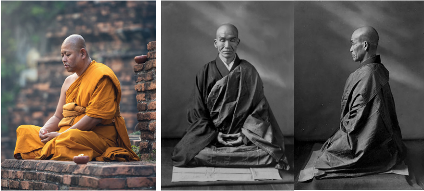
Figures 5–6: A Theravāda Buddhist meditator (left) and a Zen Buddhist meditator (center, right). 35

ages) sits erect and tall, yet relaxed. Similar to traditional Buddhists, his seated practice is designed to yield concentration ( samādhi ) and insight ( vipassanā ) into the nature of existence. However, zazen incorporates physical posture, sensation, and breath into a somaesthetic regimen.