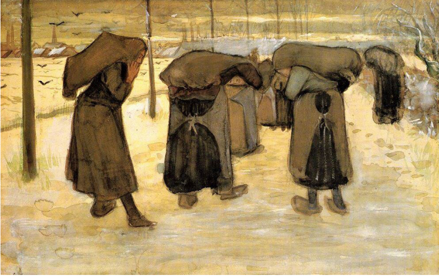
Figure 1: Vincent van Gogh, “Miners’ Wives Carrying Sacks of Coal,” 1882, Watercolor, Paper (Kröller-Müller Museum, Otterlo, Netherlands). 15

presumably refers to the discomfort of riding in a cart with a bad axle caused by one of its wheels having an off-center hole. 16 But some scholars interpret duḥkha differently, including the renowned Sanskritist, Mon-