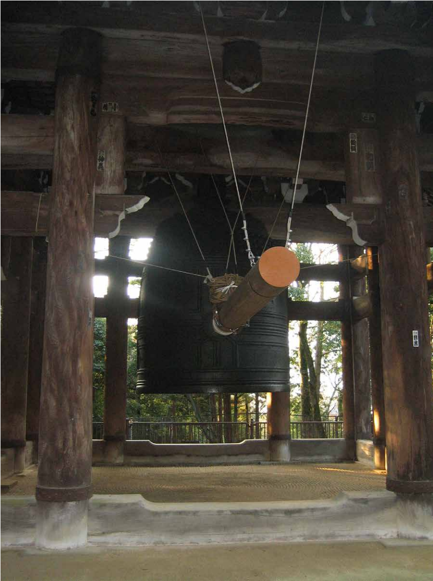
Figure 8: Ōgane (3.3 x 2.7 meters) and the Daishōrō (Great Bell Tower), Chion-in, Kyoto, Important Cultural Property.