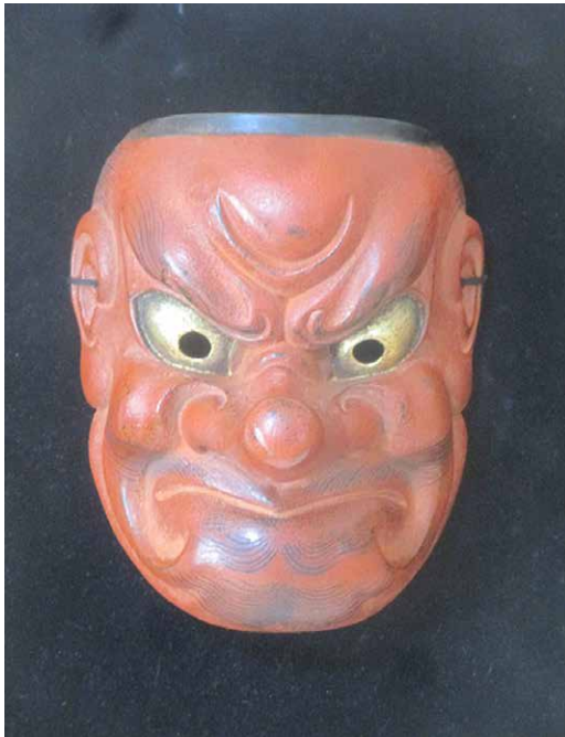
Figures 6 and 7: Actual size of tengu nō mask, made by the mask carver Hideta Kitazawa (Source: Hideta Kitazawa).