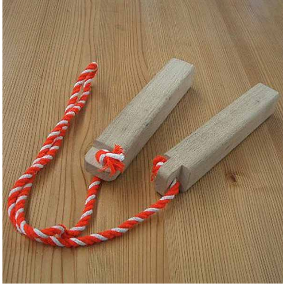
Figure 6: Hyōshigi (拍子木), a simple percussion instrument Karlin paid special attention to when visiting the theatre. It is very distinctive in kabuki, seen often as well in Shinto festivals, and used in some forms of Buddhist practice, as well as in the new Japanese religion Tenrikyō. (Hyōshigi by ja:User:Miya is licensed under CC BY-SA 3.0).

The most interesting part, where she wrote of music a little bit more, is surely on Japanese theatre and dance performances in “In the fishing villages”: 57