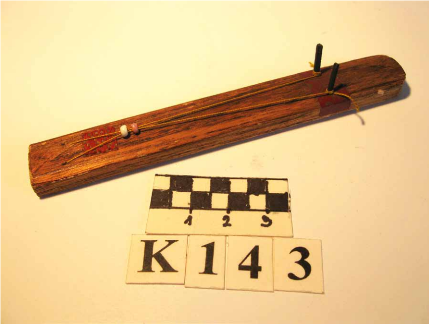
Figure 3: Miniature which features the Japanese instrument yakumo-koto, today related to the Shinto sect Ōmoto-kyō. We can find its iconography in ukiyo-e, such as Chikanobu Toyohara's works Current Beauties, Moon from the Ocean Pavilion, Evening Concerts, and others.

Some researchers even point out its relation to the Izumo cult and mention its relation to the Japanese intellectual movement kokugaku , translated as native studies or nativism , which turn to basic Shinto tradition and Japan's ancient literature. 36 Nowadays it is used in the Ōmotokyō (大本教) or Ōmoto (大本) Shinto sect, founded in 1892, during their processions and ritual practices. One of the important is a traditional poetry festival Utamatsuri , where they gather to recite or chant poems, and as well play a two string yakumo-koto , referring to the