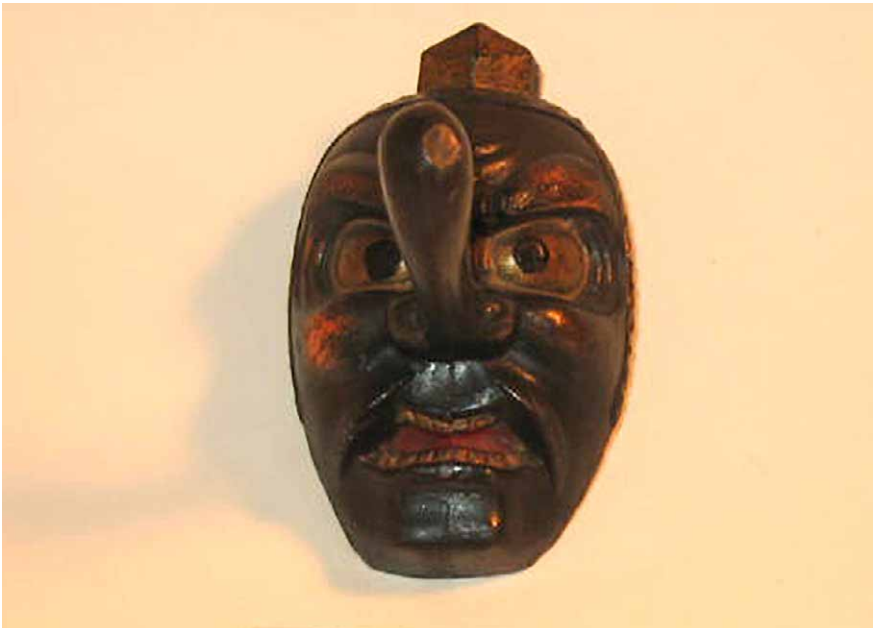
Figure 5: Small miniature of tengu mask (bronze, 6.6 x 4.1 cm), black and in some parts coloured in red and gold, with a small box tokin (兜巾) on the top of its forehead, representing a hat or a drinking cup, headwear associated with mountain monks yamabushi , whose form they often assume. It could be used as a wall hanging, as it is said that the hanging of Japanese traditional masks can bring happiness. (Collection of Alma Karlin (K24), Celje Regional Museum Archives).

Another object from Karlin's collection we could link to the Shinto religion is a small tengu (天狗, 天 stands for heaven and 狗 for dog, or heavenly dog) mask, which is in Shinto considered as kami or yōkai (supernatural being), a bird-like mystical creature, which can take part in kagura performances, and is often used for a theme in a comic monologue called a rakugo . Its significant features, a long nose protruding from a red painted face, were inspired by the Japanese mythological figure Saruta Hikononikoto (猿田彦命).