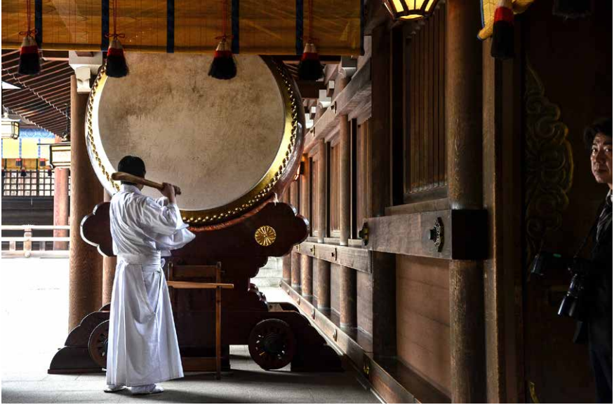
Figure 1: Calling the gods with the taiko drum, Meiji Shinto Shrine, Yoyogi Park, Tokyo, June 2014.

Shinto (or “the way to the gods/deities”), as a Japanese indigenous religion, with its practices first recorded in the written records Kojiki (“Records of Ancient Matters”) and Nihon Shoki (“The Chronicles of Japan”) in the 8th century, focuses on ritual practices related to the worship of various gods ( kami ), crucial in harvest, spring, and other festivals. It is not an organized religion, is without a founder, priest (only a ritualist), as well without sacred scriptures; but each Shinto shrine has its collections of prayers. The primary concern of its practices has remained the same; taking care of or purification of a certain place or thing, which can be done by any individual or a priest. As a symbol of purification, “pieces of bamboo, spring of sasaki , or rice-straw rope to which paper and flax pendants are attached” 16 are prepared and hanged at the purified places. The most common form related to Shinto cer-