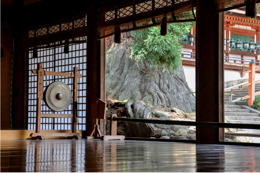
Figure 2: Gong in Naoraiden Hall and sacred millennial cedar tree, Kasuga Taisha Shinto Shrine, Nara, June 2014.

emonies which includes music is kagura , which serves as the generic name for all Shintō music and dances, with at least a thousand years of tradition. Broadly speaking, it is used in rites where purification followed by prayer offering takes place; and it appears in theatrical form tied to Japanese mythology. 17 We could literally translate it as “god music,” or as Hughes puts it “performances entertaining native deities to grant prosperity and long life” 18 . Malm proposes that kagura can be divided into three: mikagura or formalized kagura , adopted during the Heian period, featured with little change at the imperial palace 19 ,